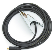
Earth return cable 5 m, 16 mm 2